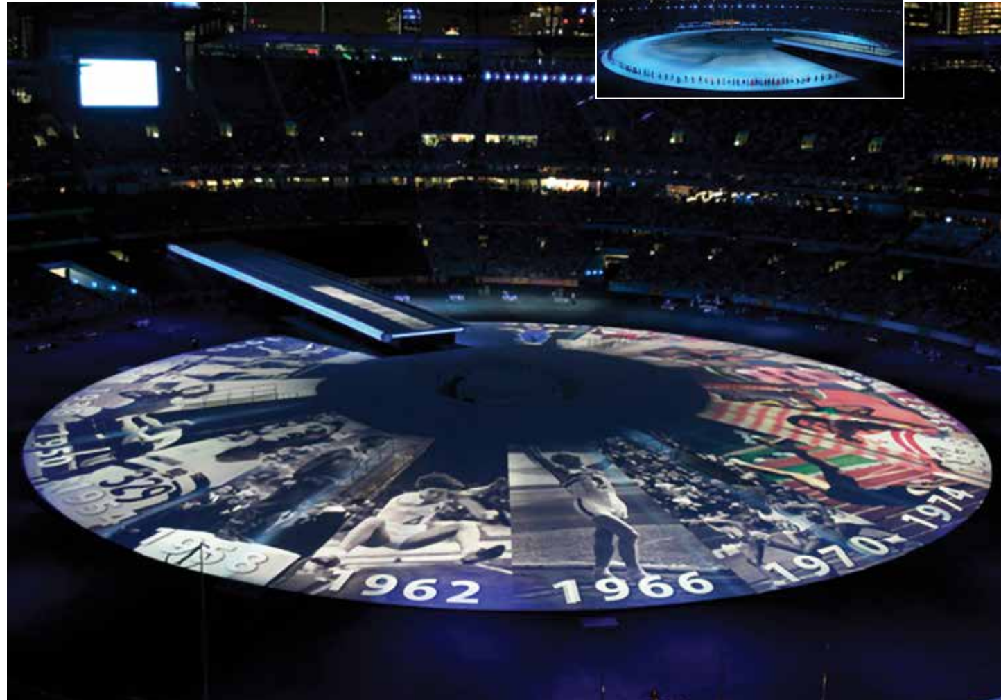
"The XVIII Commonwealth Games opening and closing ceremonies."